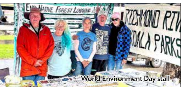
World Environment Day stall

World Environment Day Celebrated at Murwillumbah Showgrounds on 7th June, the local World Environment Day observance attracted an excellent crowd. The event, organised by the Caldera Environment Centre and Tweed Shire