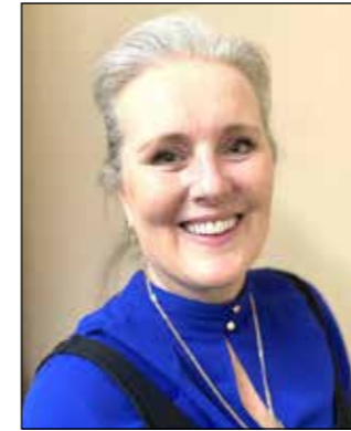
by Mayor Danielle Mulholland OAM

Council has continued to make inroads into addressing our infrastructure backlog, with more works planned across Kyogle and our villages in the coming months.