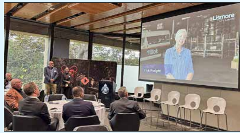
Industry briefing on the draft Local Strategic Planning Statement (and supporting strategies), held at Parliament House in Sydney.

We understand this will be disruptive for the community and