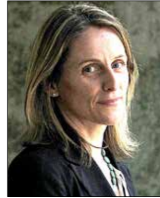
by Sue Higginson NSW Greens MLC

We're the lucky ones; we are part of a strong and sizeable regional community that used our numbers and influence to make it clear that we reject the destruction of