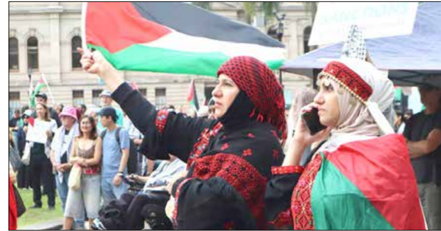
Protesters at the Nakba Day rally in Brisbane.

the slaughter of the people who had raised him: bus drivers, shopkeepers and tea shop owners. Ordinary people who had done nothing wrong lay dead in the streets. At eleven-years old, his grandfather was forced to bear witness to this.