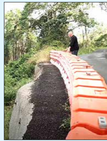
Mayor Krieg inspects the landslide on Tuntable Creek Road.

important role in our tourism economy, with local cafes, accommodation providers, galleries, retailers and markets helping to create visitor experiences and support ongoing opportunities for the community.