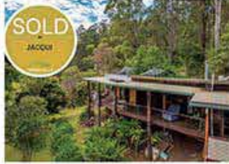
SOLD 63/265 Martin Road, Larnook 3 1 3 2 Acres $389,000 Agent: Jacqui