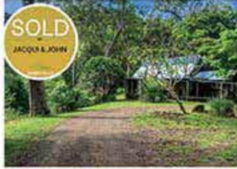
SOLD 67/265 Martin Road, Larnook 1 1 5 2 Acres $345,000 Agents: Jacqui & John