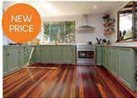
NEW PRICE 144 Link Road, Wadeville 3 1 4 2 Hectares $910,000 Agents: John & Michelle