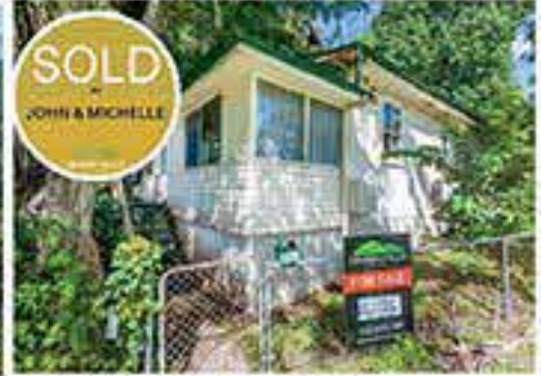
SOLD 1 Thorburn Street, Nimbin 3 2 765m 2 $560,000 Agents: John & Michelle