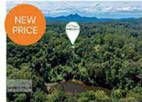
NEW PRICE 15/91 Robb Road, Lillian Rock 1 1 1 $485,000 Agent: Jacqui