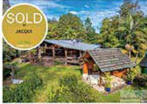
SOLD 6/265 Martin Road, Larnook 3 2 6 2 Acres $740,000 Agent: Jacqui