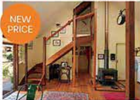
NEW PRICE 240 Stanger Road, Stony Chute 3 1 7 8 Acres $895,000 Agents: John & Michelle