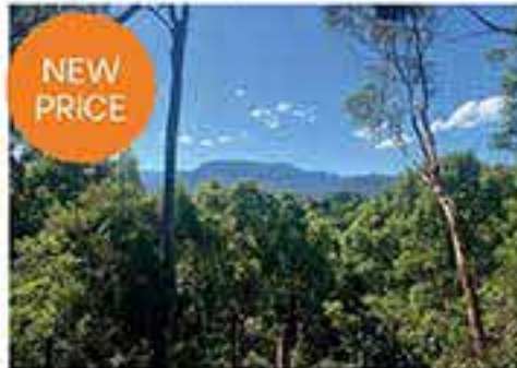
NEW PRICE 8/345 Tuntable Falls Road, Nimbin 5000m 2 $225,000 Agent: John