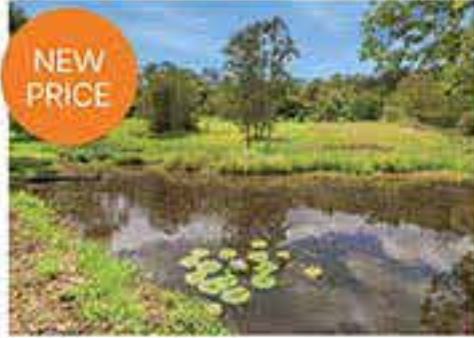
NEW PRICE 59 Abbey Road, Jiggi 3 2 1 15 Acres $810,000 Agent: Jacqui