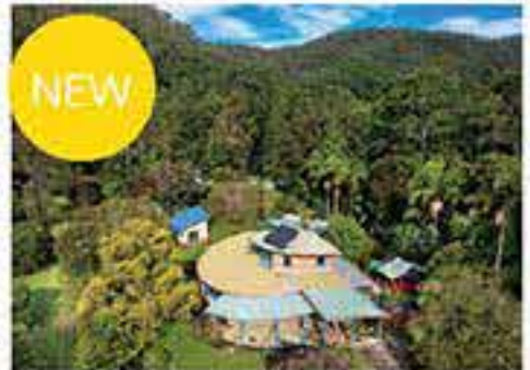
NEW 2/269 Upper Tuntable Falls Rd, Nimbin 3 1 1 2 Hectares $850,000 Agent: Samara